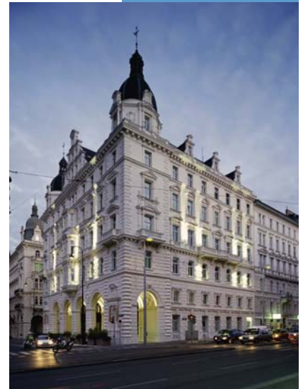
Buchart-Horn is providing Project Management services for the renewal and renovation of the facade of the historic U.S. Consulate Building in Vienna, Austria.