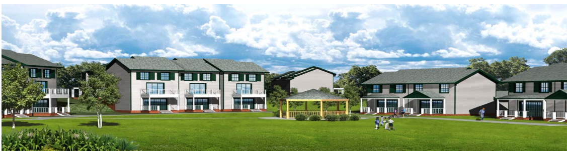
Buchart-Horn provided site evaluation, road and infrastructure layout options, building floor plans, and utility layout for multi-family dwelling units to be constructed as replacements for a total of 175 undersized and outdated units in the existing College Arms residential area of the Carlisle Army War College.