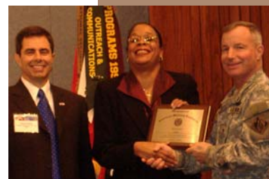
MWH 10 Years