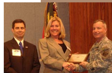
Tetra Tech FW Inc. 10 Years