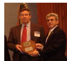
PBS&J Sustaining Member of the Year Award.