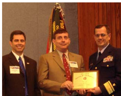
HNTB 25 Years