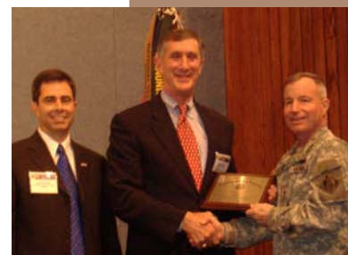
Jacobs 10 Years