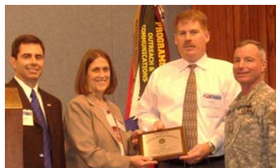
Linguist 10 Years