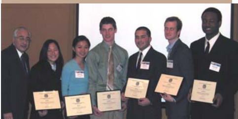
SAME Washington DC Post Scholarship Recipients attend the 2006 DC Post Scholarship Dinner at the Army Navy Club, Washington DC. (Pg. 6-7)

As we reflect on 2005, we recall a year of record accomplishments made by the SAME Washington DC Post, including training programs with record attendance, networking events that attracted new members, record fundraising for our Scholarship Program, support of our Deployed Engineer Team, Joint Meetings with other organizations, among many other successes.