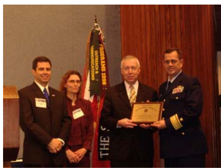
Buchart-Horn, Inc. 25 Years