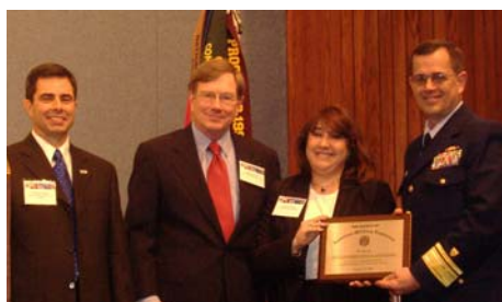
Patton Harris Rust & Associates 20 Years