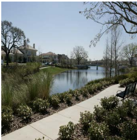
Landscape Design for Baldwin Park Mixed-use Community