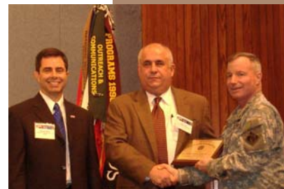
Greenhorne & O'Mara 15 Years

US Air Force Office of the Civil Engineers Consolidated Engineering Services Fluor Government Group ECS Ltd. DMJM Setty & Associates Ltd. BearingPoint Inc. Battelle Gannett Fleming Inc. Tetra Tech EM Inc. The Clark Construction Group PBS&J Dynamc Corporation Grunley Construction Co. Inc. Jones Technologies Inc.