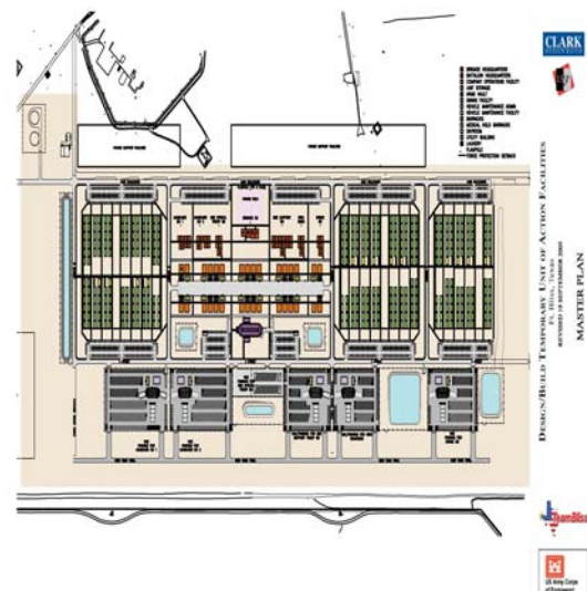
Master Plan Rendering for the Design/Build Temporary Unit of Action, Ft. Bliss, Texas

scheduled to be completed under an accelerated delivery schedule of 8 months.