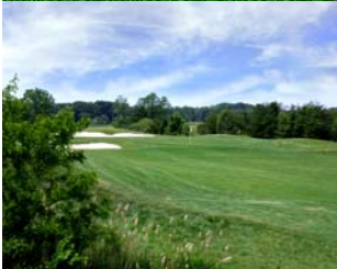
Hole 13 South Course