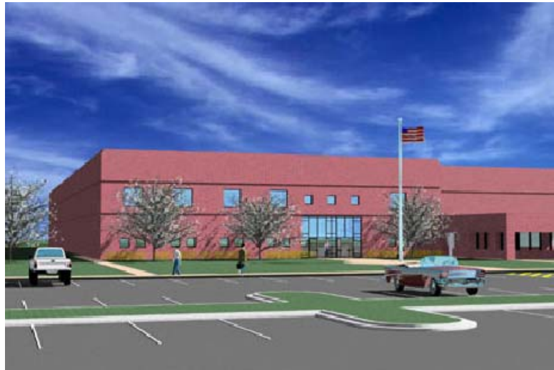
Design of Pope AFB Technical Training Facility for CC-130J Aircraft.

With a parallel dedication to both community and professional service to the professional growth and job satisfaction of its employees, PBS&J has recently been recognized as the #2 Best CE Firm to Work For by CE News magazine, the U.S. Army Corps of Engineers Southern Atlantic Division and Baltimore-Washington Corridor Chamber of Commerce 2002 Large Business of the Year, and ESRI's (GIS) Foundation Partner of Year 2003.