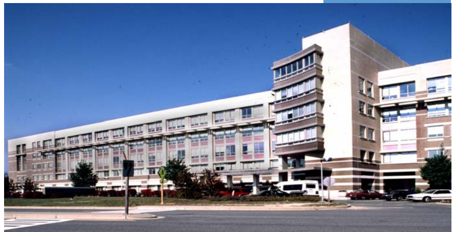
Performed leak detection studies in Naval Air HQ building.

PBS&J is proud to be a Sustaining Member of SAME and a Corporate Sponsor of the Washington DC Post and salutes our Armed Forces and Military Engineers.