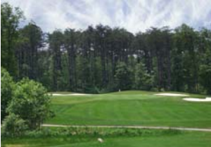
Hole 11 South Course