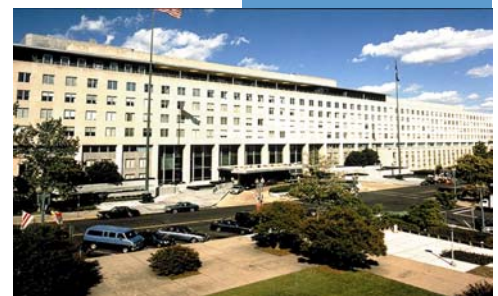
Department of State Modernization.