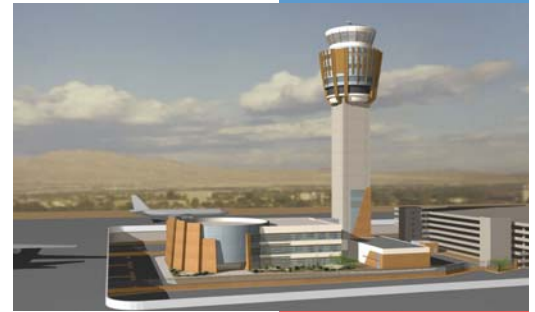
Phoenix ATCT & TRACON.