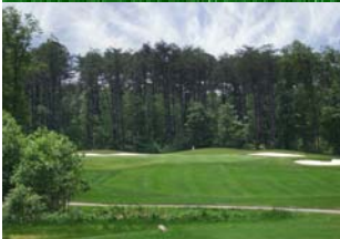
Hole 11 South Course