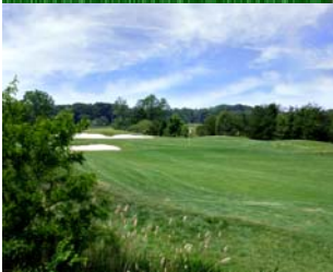
Hole 13 South Course