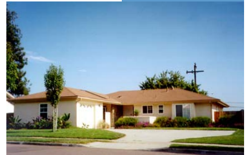
Admiral Hartman Military Family Housing.