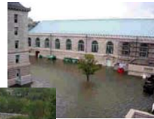
Kelly Court, Dahlgren