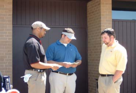
A Group of Players gather together for a Strategy Meeting.