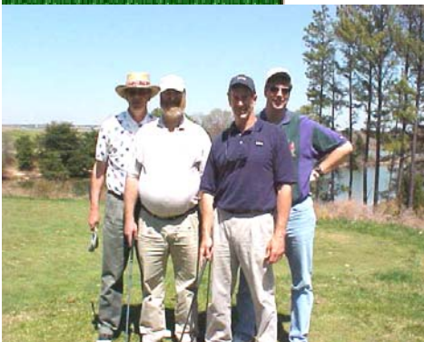
Team Members take a break to pose for a Camera Perfect Shot.