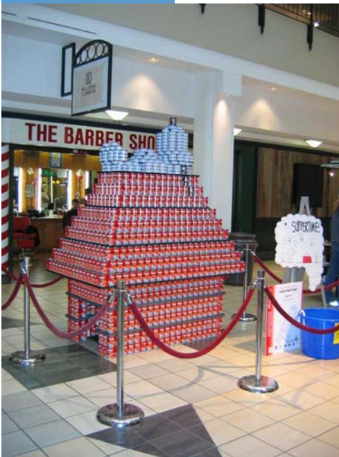
URS Washington DC office CANStructs Snoopy sleeping on his doghouse out of 2,100 cans, to represent the team's theme "Making The Dream a Reality".

CANstruction, a not-for-profit foundation of the Society of Design Administration, was initiated a decade ago to support the following mission: CANstruct a World Without Hunger. Now, more than 80 cities nationwide participate in the annual competition, donating the canned goods to local shelters, clinics, soup kitchens, emergency pantries and hospices.