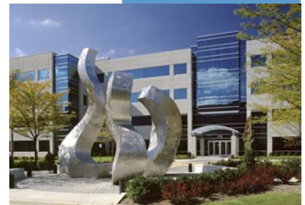
National Business Park Building 201