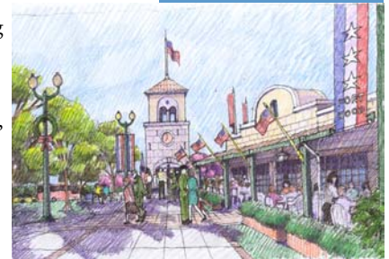
Fort Hood Main Street Planning