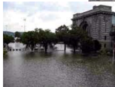
Mid-Store Parking Lot and McDonough Hall

We look forward to seeing all of you at this event.