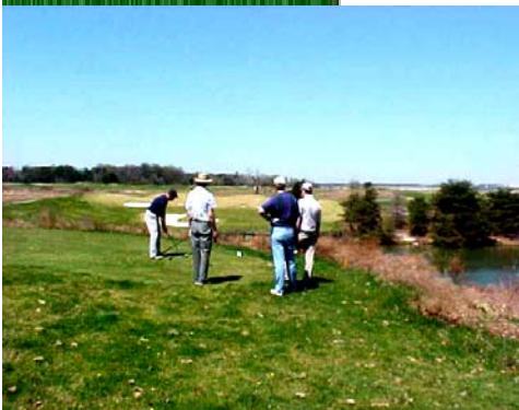
Teeing off at the water hole.