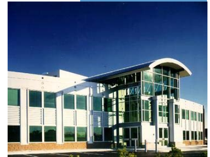
Cargo Building at BWI Airport