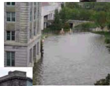
Landward side of 8th Wing and Lejeune Hall