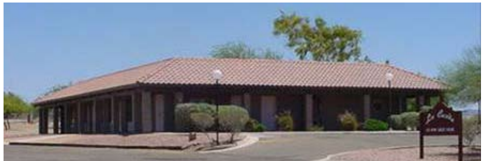
Design-Build Army Lodge Renovation, Yuma Proving Ground, AZ