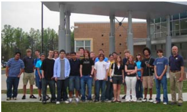
Lake Braddock Secondary School Students