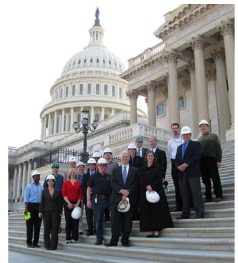
Attendees at the YM Capitol Visitor Center Tour

And remember - All SAME members are welcome at Young Member events!