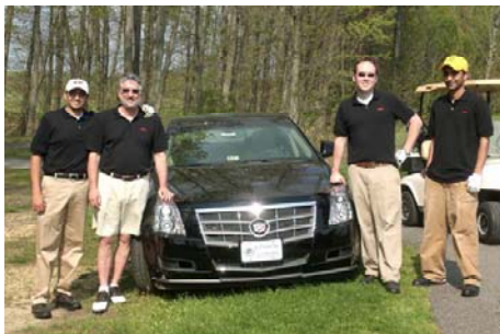
KBR team hoping to win the Hole-in-One Car Prize