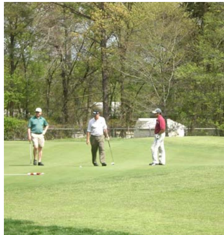
Players at the 2008 Scholarship Golf Tournament