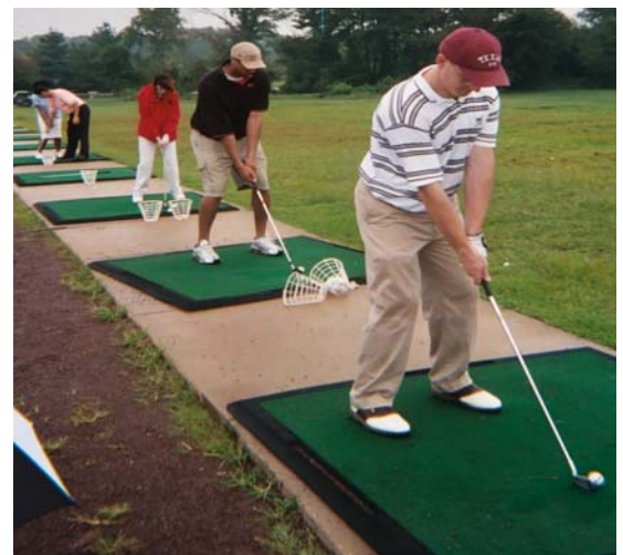
SAME members take a golf clinic held early afternoon.