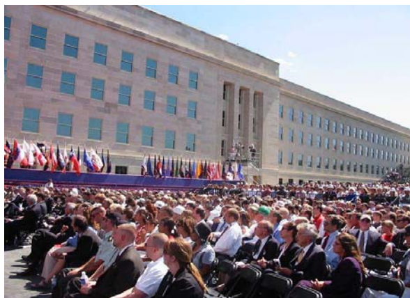
The Phoenix Project, The Pentagon