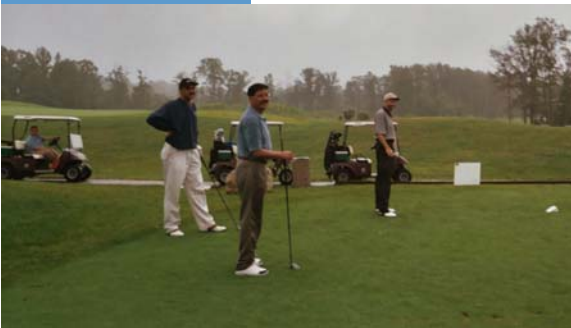
EA's Team confidently takes the tee.