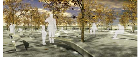
9-11 Memorial, The Pentagon

3D/I holds a Top Secret Facility Clearance and has a substantial number of highly qualified personnel with current Top Secret and Secret security clearances. The firm works in classified project environments routinely and has the internal process and procedures operational to handle matters of clearance. Much of the work is through IDIQ task order type contracts. Among them are contracts with General Services Administration, Air Force, Army, Department of Defense, and major urban K-12 School Districts. 3D/I understands the contractual requirements and knows how to manage its resources, and the resources of sub-consultants, to ensure timely and quality delivery of services to each client.