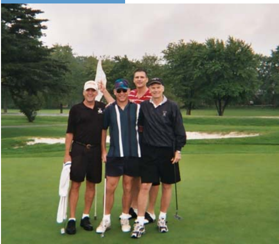
The Army team shows its support for the DC Post Scholarship Fund.

Thank you to all of the 122 golf tournament participants and to the golf clinic participants for making this year's tournament a great success! See you next year!!!!