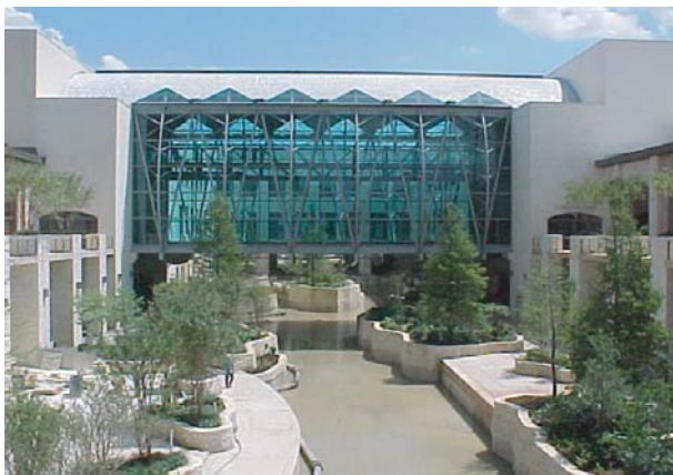
San Antonio Convention Center