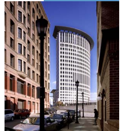
Cleveland Federal Courthouse

The firm designs, builds, manages and consults on projects for government, educational and commercial clients. Services include: