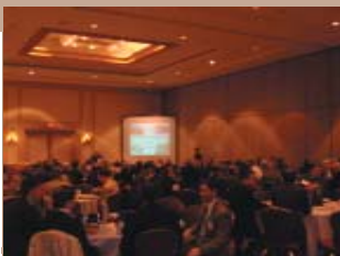
Federal Opportunities Industry Day Pg. 11