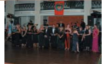
SAME Washington DC Post Scholars & Honors Gala, Pg. 8