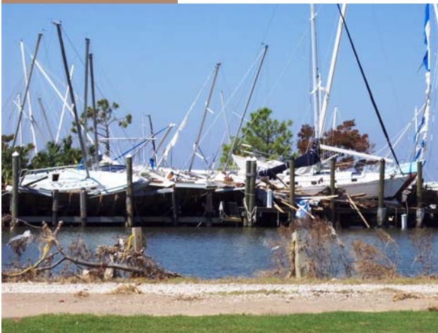
Sail boats capsized at Lake Pontchartrain Yacht Club.

A Web site is available through USACE for the public to track progress on Task Force Guardian and other efforts to reconstruct and provide additional protection to the New Orleans region.