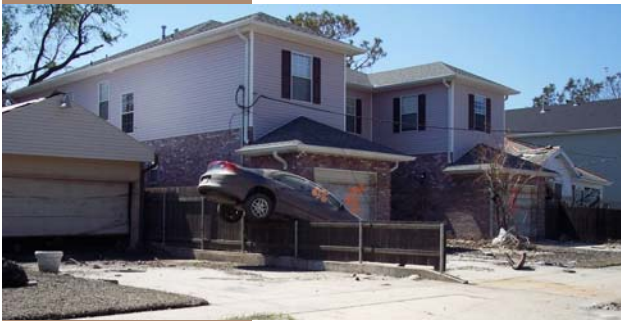
Hurricane Katrina flood waters re-parked cars in Orleans Parish.

Stanley Consultants has been tapped by the U.S. Army Corps of Engineers to assist with hurricane recovery repairs in New Orleans. The company was awarded a Quality Control and Management Support task order to support the effort through an existing contract. A six-member team is currently in New Orleans assisting with the effort.