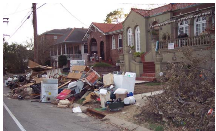
Flood damaged possessions moved to the curb in Orleans Parish.