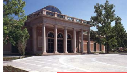
Volkert managed the civil and site engineering for the design of the Arlington National Cemetery Visitors Center.

In addition to local DoD/federal work, Volkert supports the USACE Mobile District; U.S. Navy Homeport, Mobile; Air National Guard, Birmingham; and Hurlburt and Eglin Air Force Bases in Florida. ■