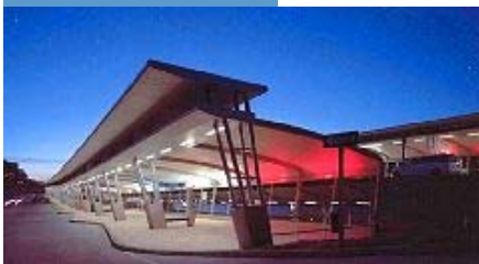
Pentagon Metro Entrance Facility