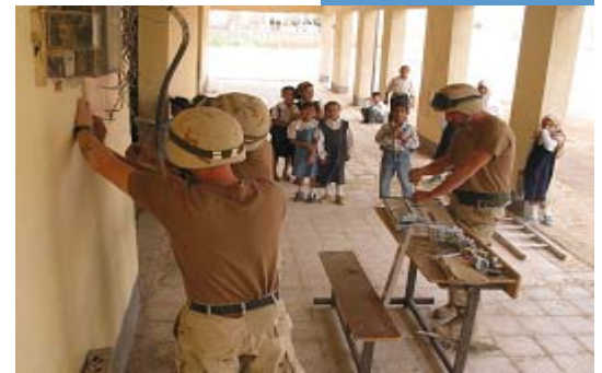
Seabees repairing a school while curious Iraqi children look on with delight.

What made Rear Admiral Kubic's presentation so informative was the empirical data on infrastructure improvements. What made it so moving were the captivating images.