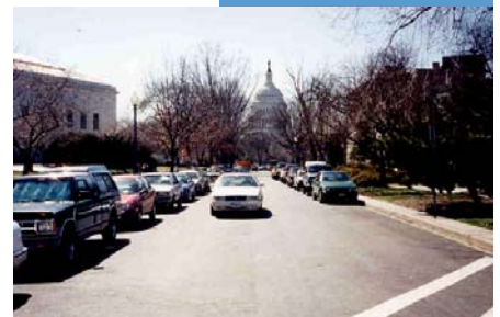
Volkert conducts traffic studies for roadway & security improvements in the US Capitol Complex.