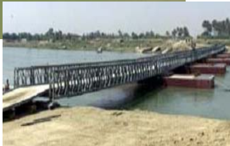
Completed construction of the Az Zubaydiyah Pontoon Bridge