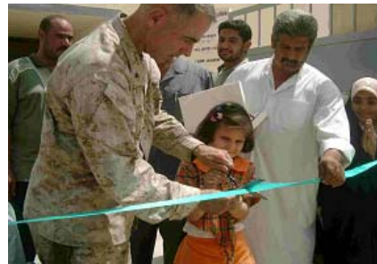
Rear Admiral Kubic assisting at a Ribbon Cutting ceremony