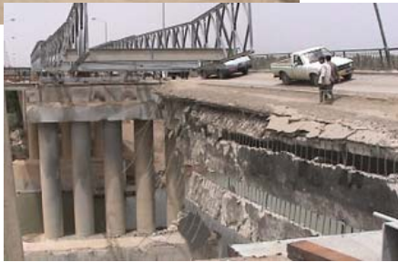
Ongoing construction of the bridge at Az Zubaydiyah Pontoon Bridge, 25 June 2003