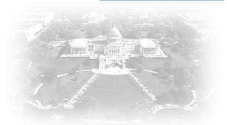
Volkert is performing civil engineering services to support the new Capitol Visitors Center.