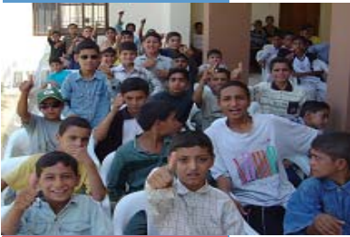
Iraqi children give their Thumbs Up