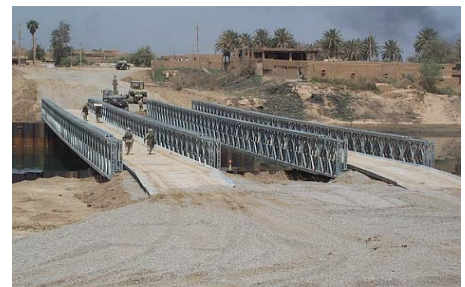
Baghdad New Highway Bridge S over Diyala River, April 2003