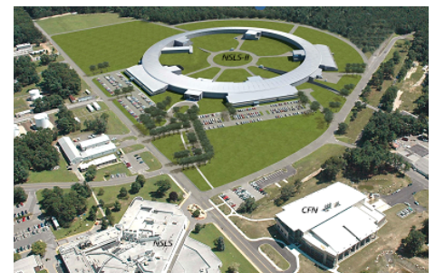
National Synchrotron Light Source II at Brookhaven National Laboratory, New York