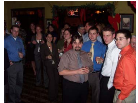
Young Members Networking Happy Hour

And remember - All SAME members are welcome at Young Member events!