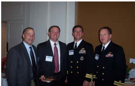
Attendees Enjoying the 2008 Holiday Party