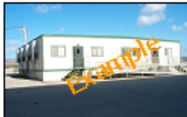
Slide from Brian Sanders presentation on USMC